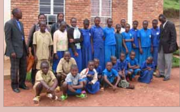
The Presbyterian Church in Rwanda ministers to these orphans who lost their parents in the genocide or to AIDS.

In the 1930s a revival that began in Gahini (the first Anglican mission) became one of the most important movements of spiritual renewal throughout East African Protestantism. In the 1950s the Catholic church began actively to support the demands for the end of the unequal relations between Tutsis and Hutus. This contributed significantly to the 1959 revolution, the